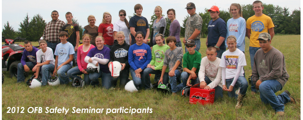
2012 OFB Safety Seminar participants