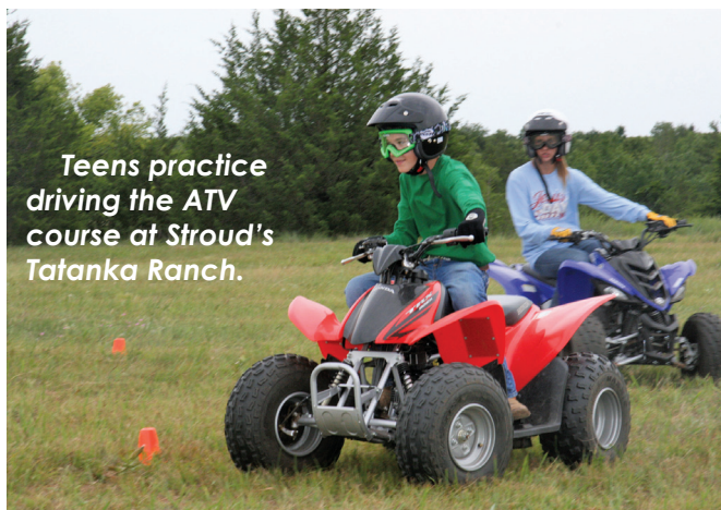
Teens practice driving the ATV course at Stroud's Tatanka Ranch.

After completing the course, the students received an ATV safety certificate. Other annual activities at the three-day seminar included a rollover simulator demonstration from the Oklahoma Highway Safety Council, a team building ropes course and also new this year, gun safety and shooting sports training from the Oklahoma Wildlife Department. (Continued on page 2)