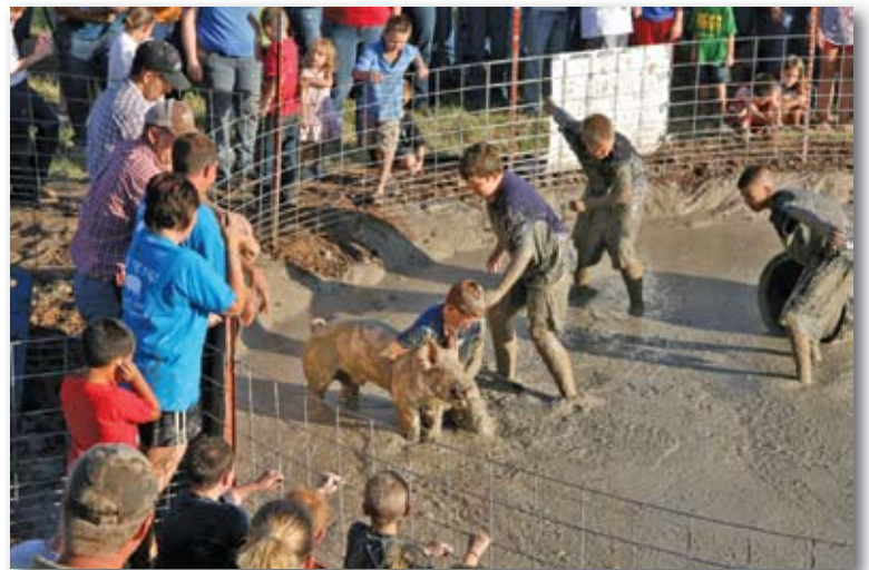
Approximately 300 people came out to cheer on competitors during the Major County Farm Bureau Young Farmers & Ranchers Pig Wrestling Contest Aug. 27. The annual fundraiser and membership drive, held in Fairview, drew participants and spectators of all ages. The local fire department also was on hand to hose off all contestants exiting the mud-filled ring.