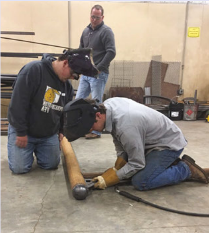
Members of the Perkins-Tryon FFA Chapter weld H braces in an effort to help rebuild miles of fences destroyed in wildfires in northwest Oklahoma.