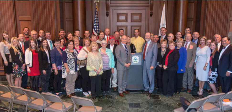
OKFB members visit the U.S. EPA and hear from Oklahoma native and EPA Administrator Scott Pruitt during the OKFB Congressional Action tour.

Oklahoma family farmers and ranchers experienced a new excitement in Washington, D.C. during the Oklahoma Farm Bureau Congressional Action Tour March 28 through April 2. OKFB members for years have traveled to Washington, D.C. to fight excessive regulations from the federal government. With a change in administration, OKFB members left the nation’s Capitol optimistic for the first time in years. The trip began on a high note with a visit to the U.S. Environmental Protection Agency to see Oklahoma native EPA Administrator Scott Pruitt. Only a few months into his tenure as administrator, Pruitt has worked to rescind and review onerous regulations like the Waters of the U.S. rule and the Clean Power Plan. “You know what’s wonderful? You all are spending time at the EPA and you’re still smiling,” Pruitt said,