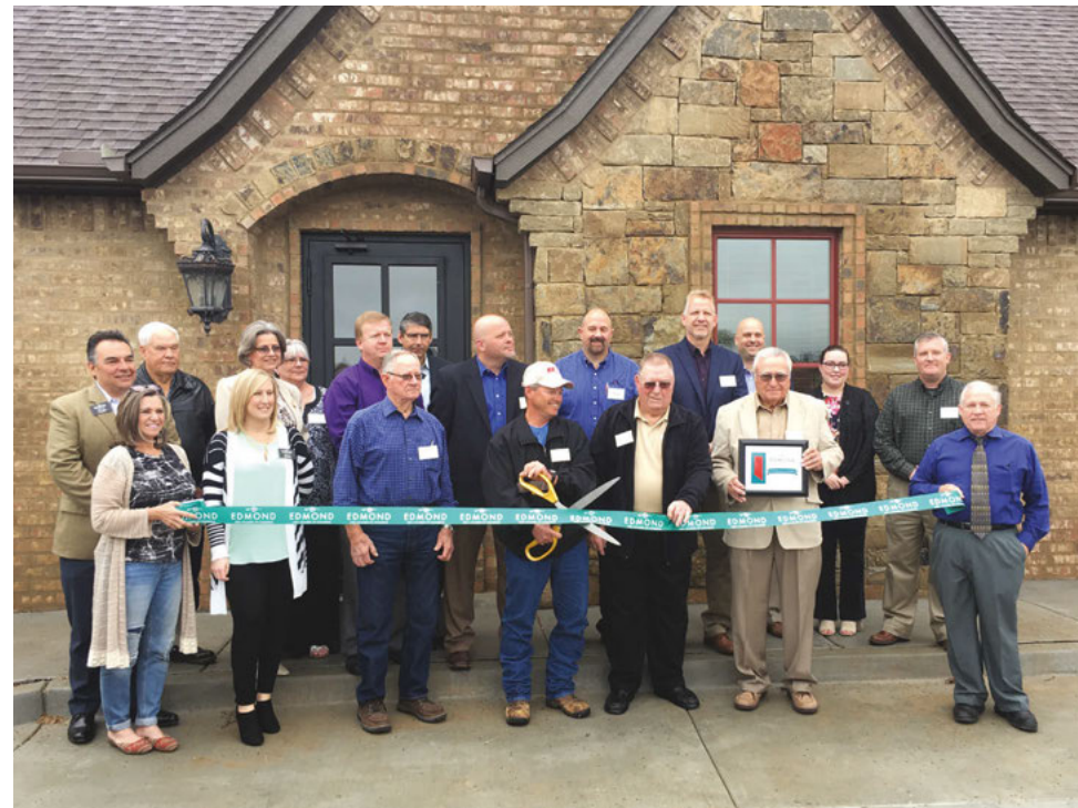
Oklahoma County Farm Bureau hosted an open house and ribbon cutting to celebrate their new location in Edmond on March 29. In an effort to better serve their members, Oklahoma County Farm Bureau recently moved to the new office located at 2924 Astoria Way, Suite 100, Edmond, OK 73034. Although their office phone number will remain (405) 525-2607 and (405) 340-5087, they have a new fax number: (405) 340-5028.