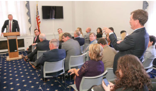
Top Left: Rep. Jim Bridenstine says tax reform is the next priority following ACA repeal. Top Right: Sen. James Lankford discusses relief for Oklahoma wildfire victims, among others. Bottom Left: Sen. Jim Inhofe shares his work alongside President Trump to repeal regulations like WOTUS and the Clean Power Plan.