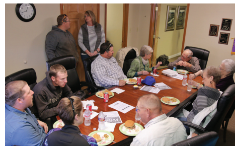
Cotton County Farm Bureau held an open house with a free meal and door prizes.