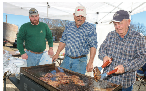
Noble County Farm Bureau had a great turnout for their hamburger and hot dog feed.