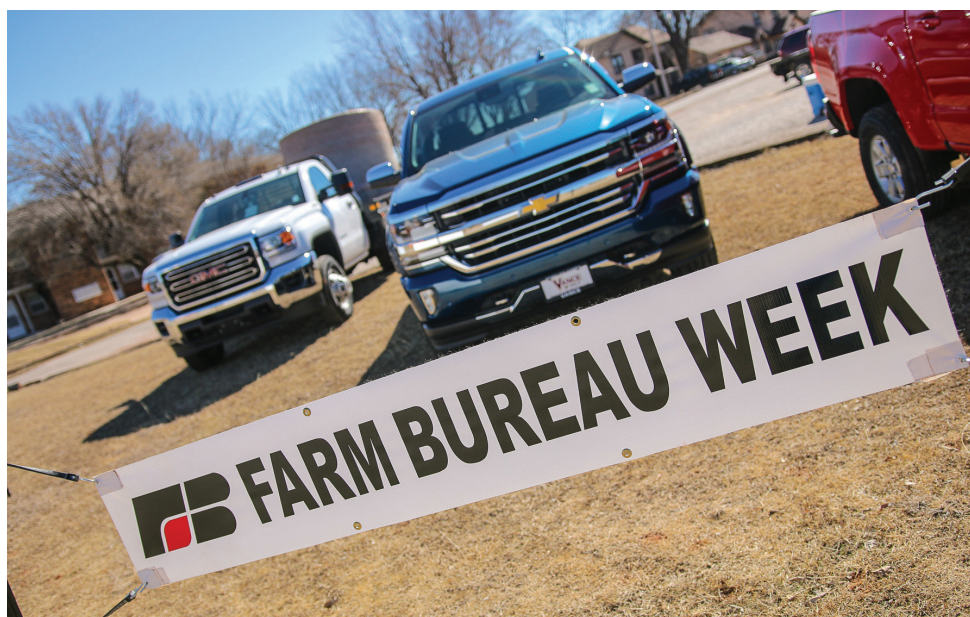
At Noble County Farm Bureau's hamburger and hot dog feed, Vance Chevrolet brought several Chevy trucks for display that Farm Bureau members can receive a discount on.

nities. It was also a great opportunity for county Farm Bureaus to gain members and become active in the community. Many county offices hosted open houses to allow those interested in Farm Bureau to stop by and learn more about the organization.