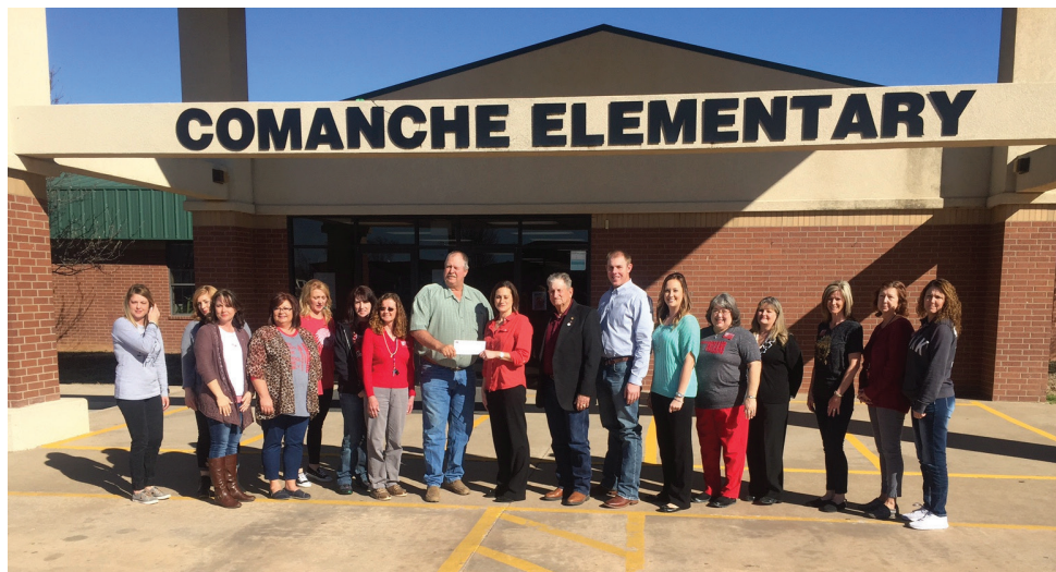
Stephens County Farm Bureau made a donation to a local school, Comanche Elementary School, in honor of Farm Bureau Week. The donation will help teachers buy supplies.