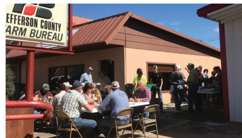
Jefferson County Farm Bureau had a large crowd for their open house with a great meal.