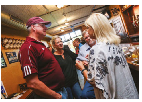
Above left: OKFB hosted the "Get on Tap with 777" at McNellie's Abner Ale House in Norman. Top right: Attendees received promotional "Yes on 777" vehicle stickers at the event. Bottom right: Oklahoma voters discuss the benefits of the Right to Farm amendment.