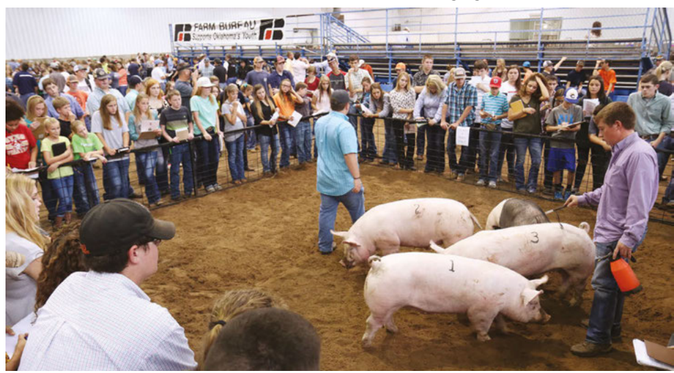
Livestock judging contestants evaluate a swine class during the Oklahoma State Fair contest hosted by the Oklahoma Farm Bureau Young Farmers and Ranchers.

Full results from the contest can be viewed at Judging Card.com.