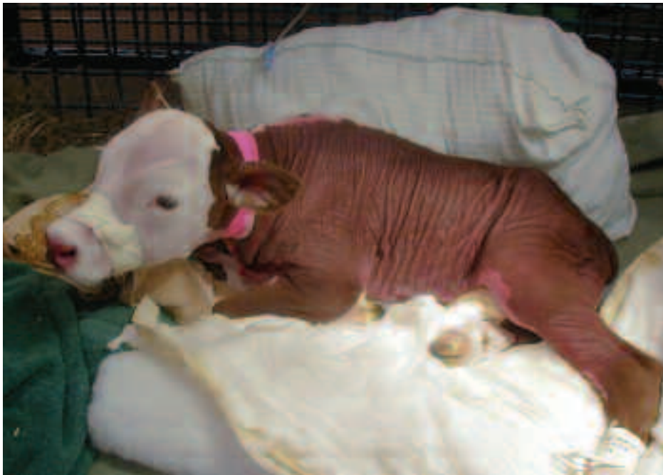
Above: This Sept. 1 photo shows Norman the calf upon his admittance to the teaching hospital. Born the previous day on the Poteau ranch of Monte Shockley Jr., the calf weighed just 26 pounds and was not expected to survive.