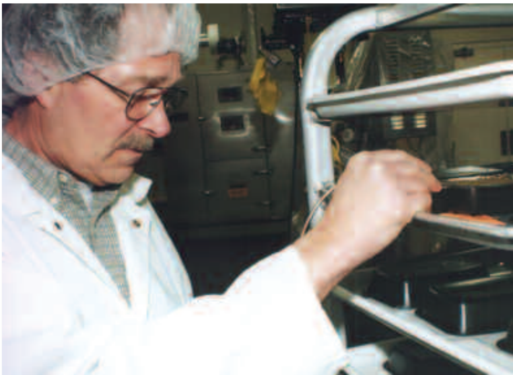
Below: Food & Agricultural Products Center pilot plant manager works closely with Granna's as the business continues to find success in a niche market.