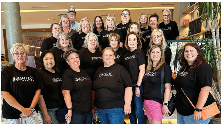
Members of the Oklahoma Farm Bureau Women's Leadership committee pose with a group of Oklahoma teachers at the National Ag in the Classroom Conference June 24-27 in Salt Lake City.