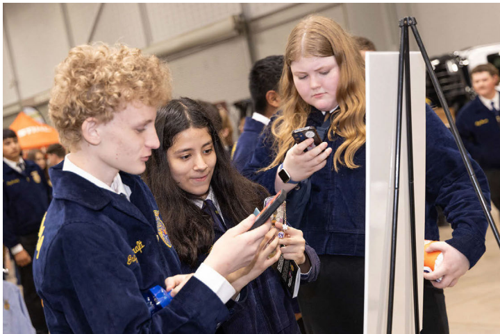
FFA members sign up for giveaways at the OKFB career fair booth during the 2024 Oklahoma FFA Convention. OKFB connected with FFA members and shared the organization's numerous ag youth programs with convention attendees.